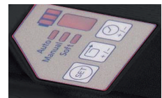
Digital control panel

Suitable for carton strapping applications