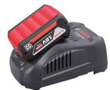
Bosch battery & charger