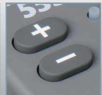
Random Key Length To allow tape to be dispensed in any length.

For more information on the range of Xtegra® security optimised packaging products, please visit: