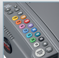
Programmable Keys Set tape lengths up to 305cm depending on model. Tape length is adjustable (up or down) in 12.7mm increments.