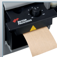
Automatic Function Allows the operator to specify tape lengths and will automatically dispense them in a pre-configured sequence, to dramatically increase productivity.