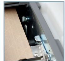
Steel frame construction covered with ABS plastic For strength, durability and impact resistance.