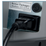
Extra long detachable cord For improved operator ease, comfort and safety.