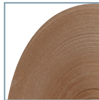
Largest tape capacity in the industry Eliminates the need for frequent roll changes.