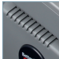
20% increase in motor power For longer life, cooler running and smoother operation.