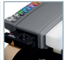
Ergonomic design Allows for operation from either side of machine.